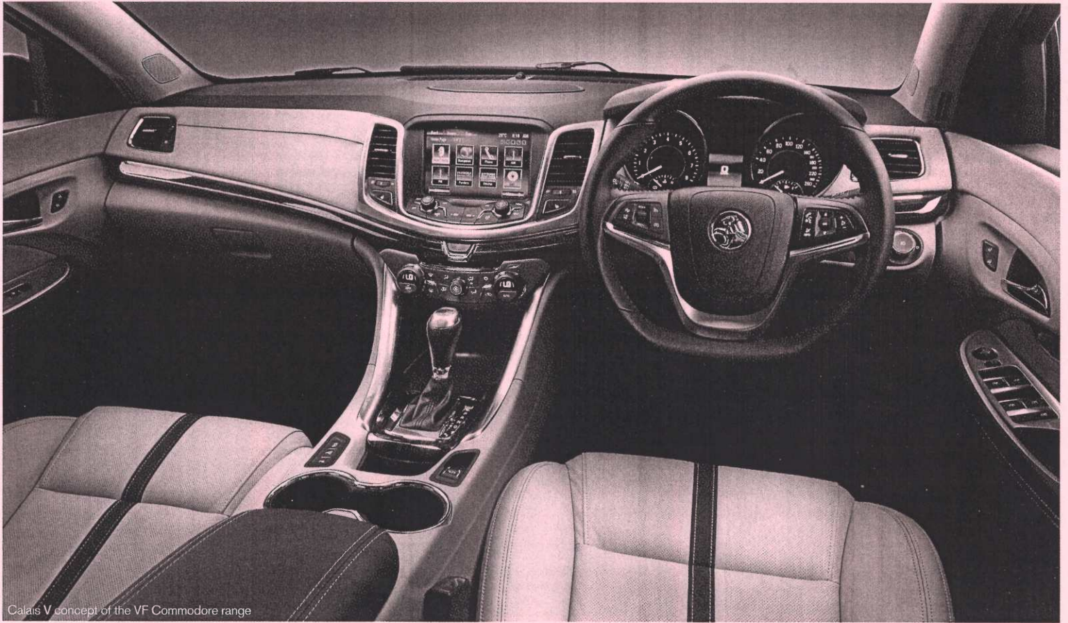
Calais V concept of the VF Commodore range