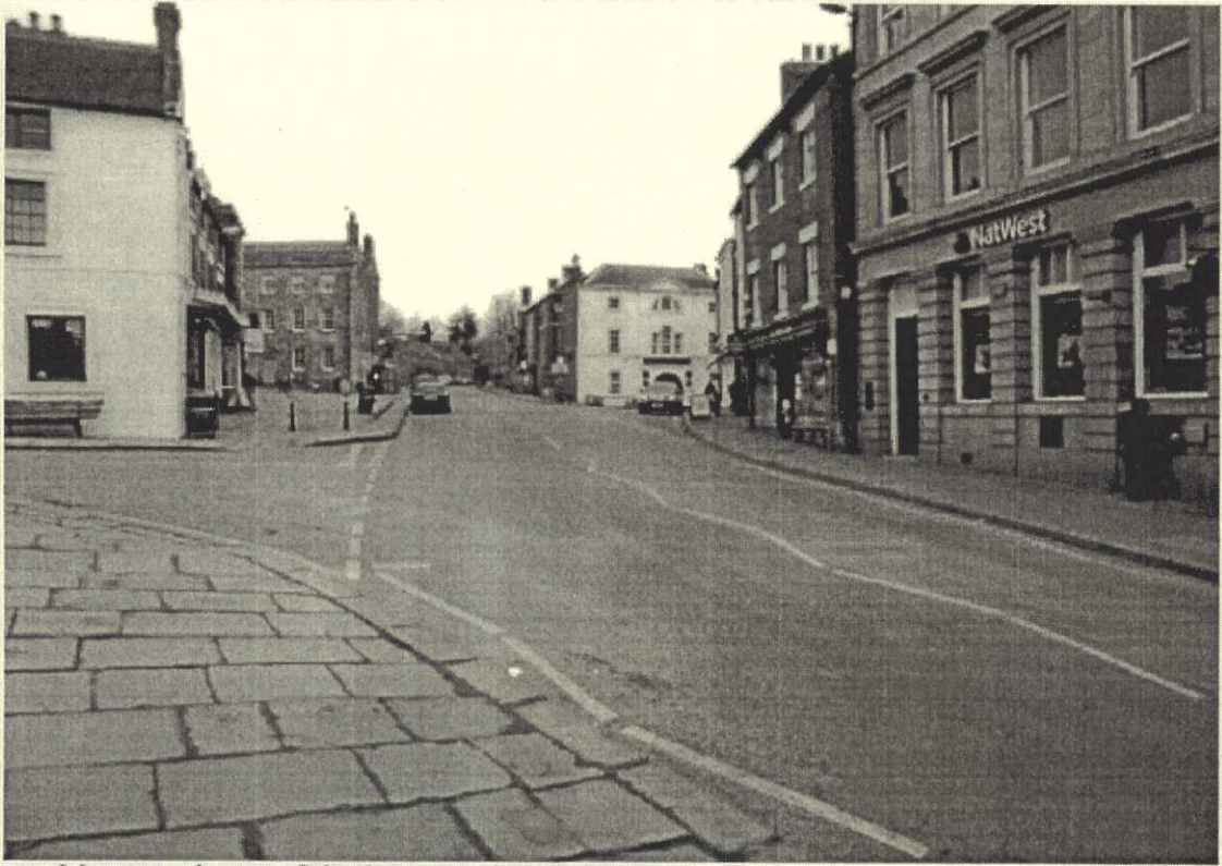
Looking North out of the bottom of the market place the diverse nature of Wirksworth's architecture is apparent – on the right is the historic Red Lion, an old coaching inn .